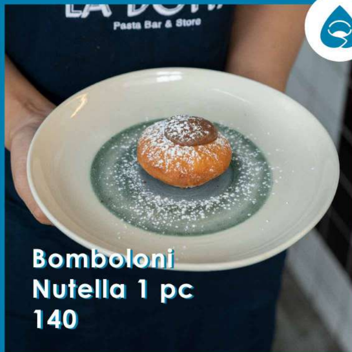
Bomboloni Nutella 1 pc 140