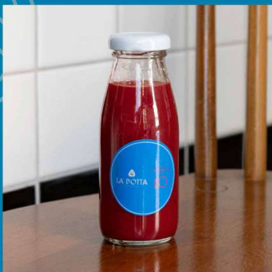
Carrot & beetroot 100