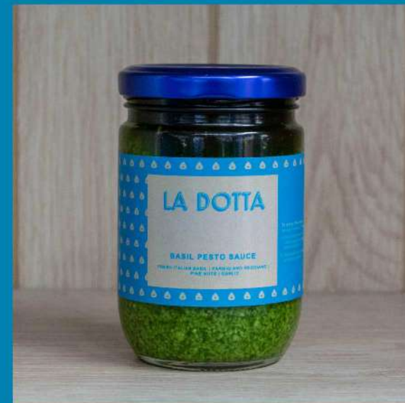
Pesto alla Genovese (2-3 portions) 420