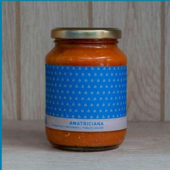
Amatriciana M (2-3 portions) 490