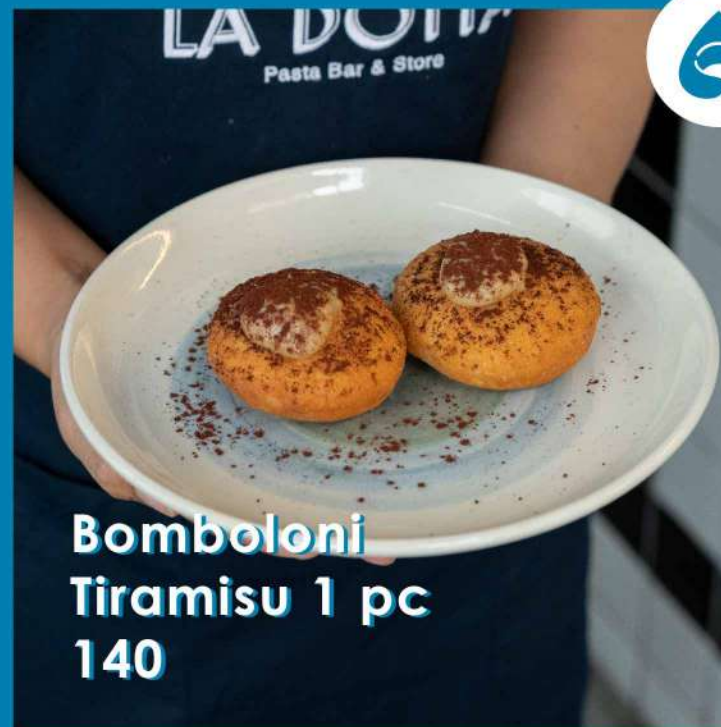
Bomboloni Tiramisu 1 pc 140