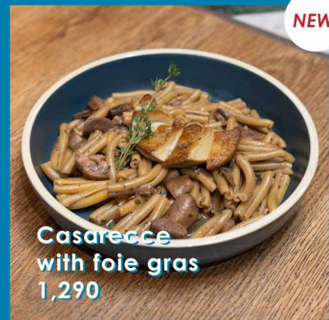
Casarecce with foie gras 1,290

* Price is subject to govt. tax * Delivery fee is excluded * Please allow our service team to reconfirm your order as some items might not be available