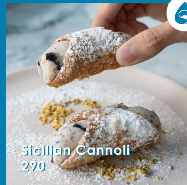
Sicilian Cannoli 290

* Price is subject to govt. tax * Delivery fee is excluded * Please allow our service team to reconfirm your order as some items might not be available