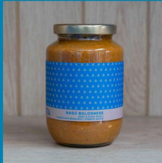
Ragù bolognese M (2-3 portions) 490