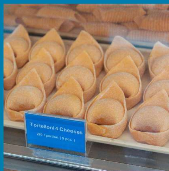
Tortelloni 4 cheeses (fresh pasta - 9 pcs) 340