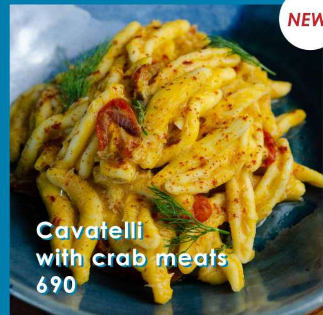
Cavatelli with crab meats 690