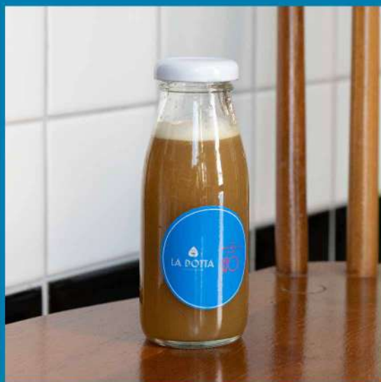
Green apple 100