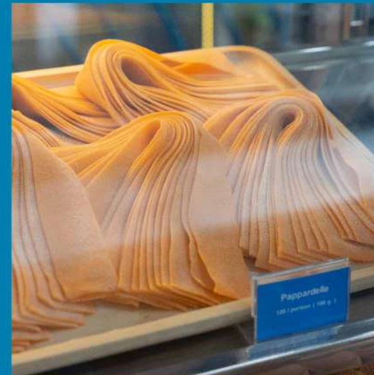
Pappardelle (fresh pasta - 100 g) 140