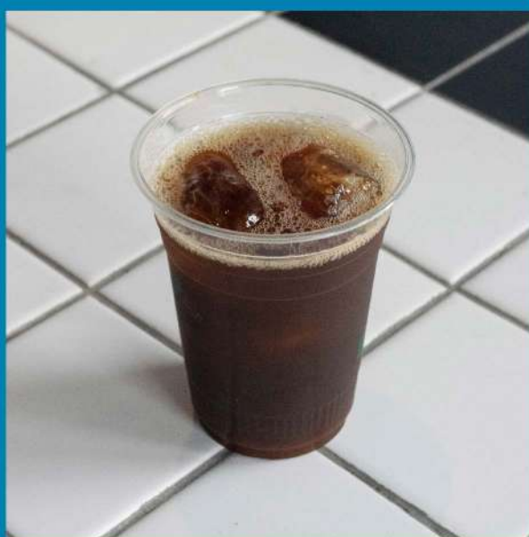
Iced Americano 100