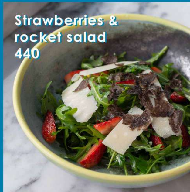
Strawberries & rocket salad 440