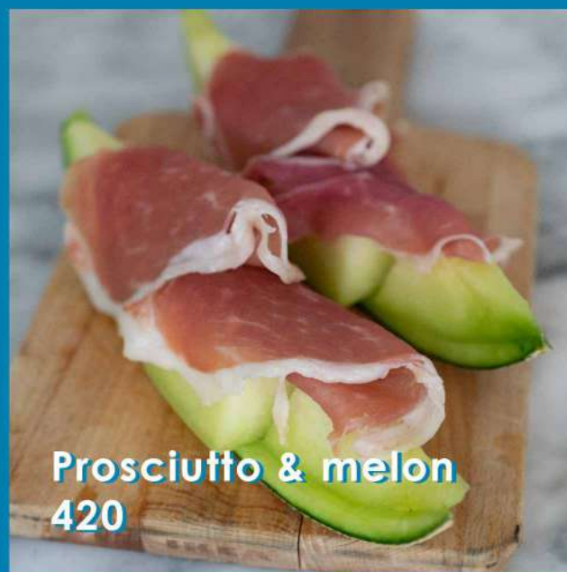
Prosciutto & melon 420