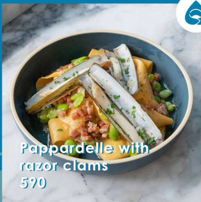
Pappardelle with razor clams 590