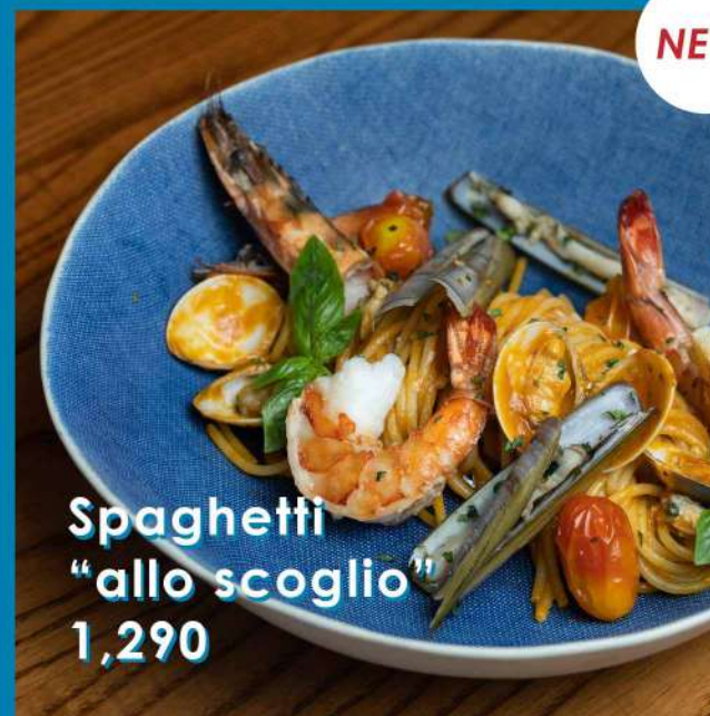
Spaghetti "allo scoglio" 1,290