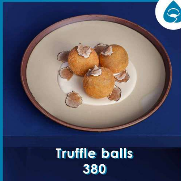
Truffle balls 380