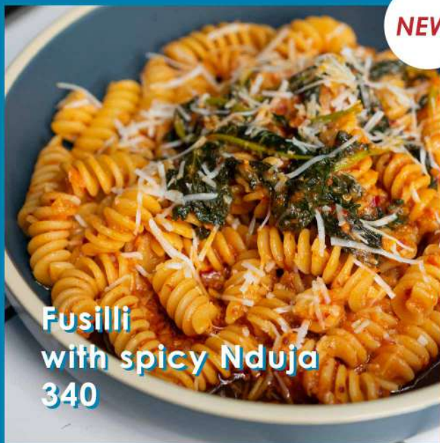
Fusilli with spicy Nduja 340