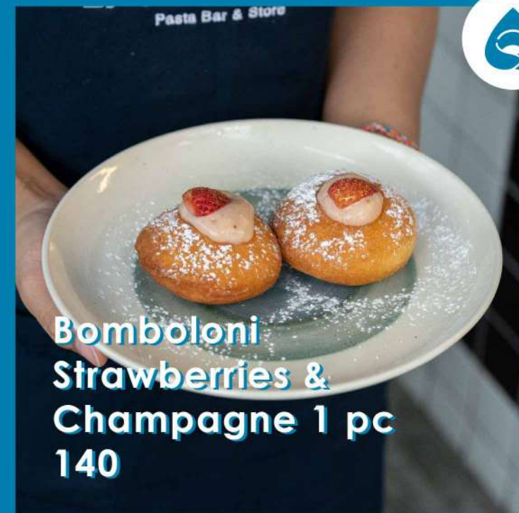
Bomboloni Strawberries & Champagne 1 pc 140