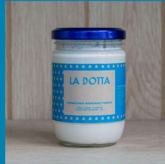
Parmigiano Reggiano Fondue (2-3 portions) 420