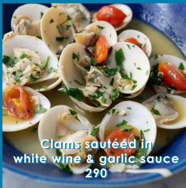
Clams sautéed in white wine & garlic sauce 290