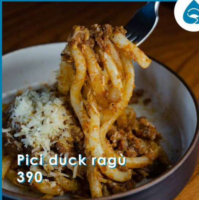
Pici duck ragù 390