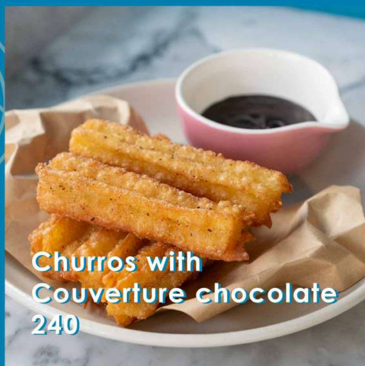
Churros with Couverture chocolate 240