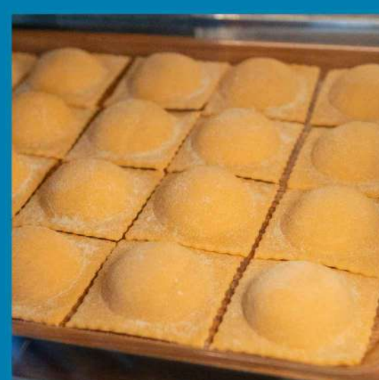
Burrata Ravioli (fresh pasta - 5 pcs) 340

* Price is subject to govt. tax * Delivery fee is excluded * Please allow our service team to reconfirm your order as some items might not be available