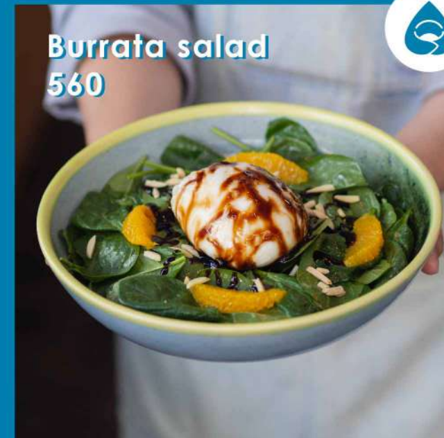
Burrata salad 560