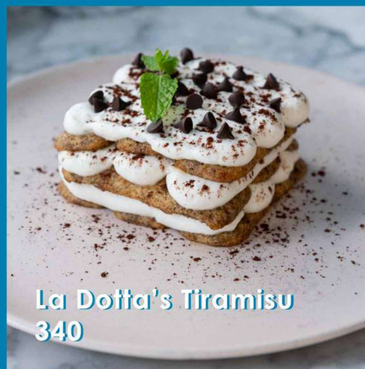
La Doffia's Tiramisu 340