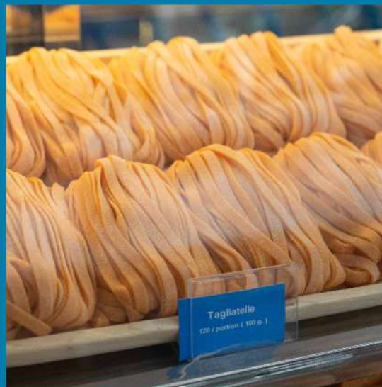
Tagliatelle (fresh pasta - 100 g) 140