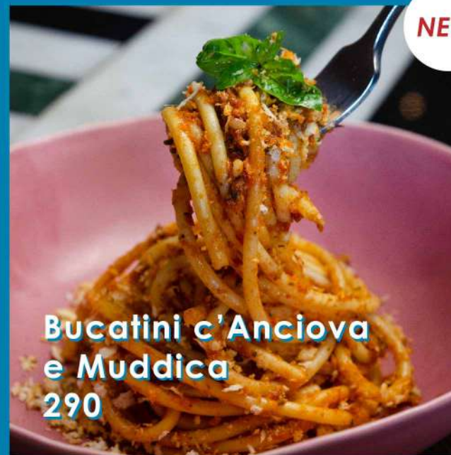
Bucatini c'Anciova e Muddica 290