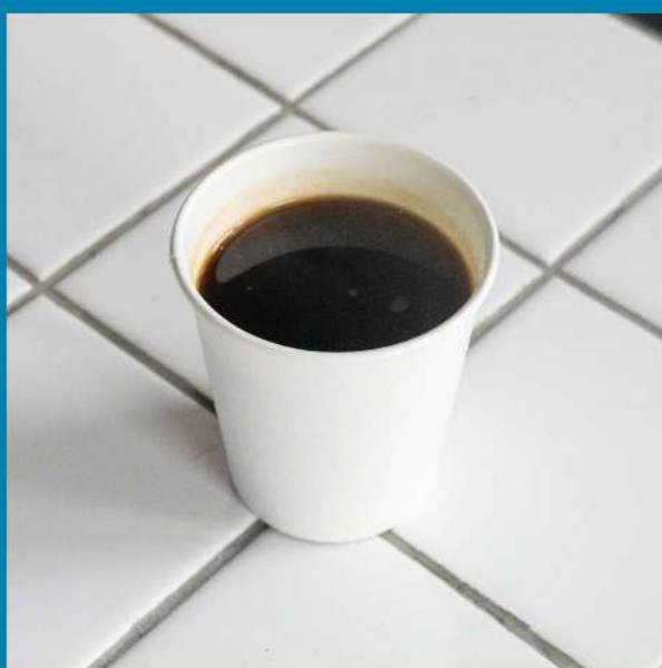
Hot Americano 100