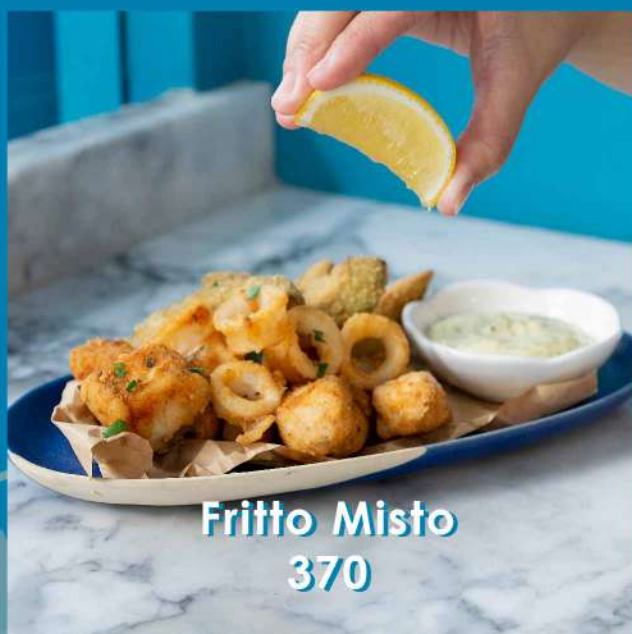
Fritto Misto 370