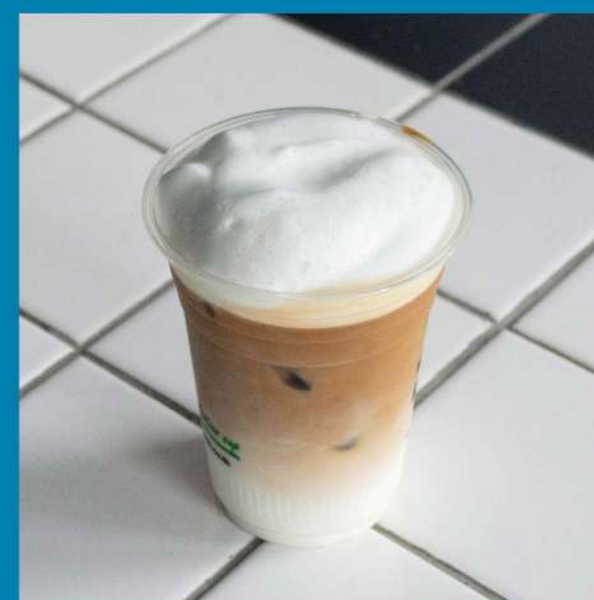
Iced Cappuccino 120

* Price is subject to govt. tax * Delivery fee is excluded * Please allow our service team to reconfirm your order as some items might not be available