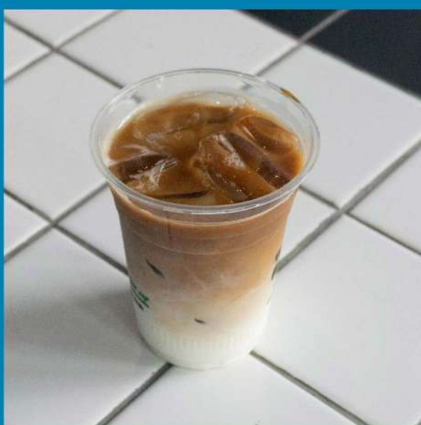
Iced Café Latte 120