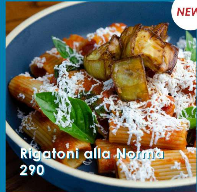
Rigatoni alla Norma 290