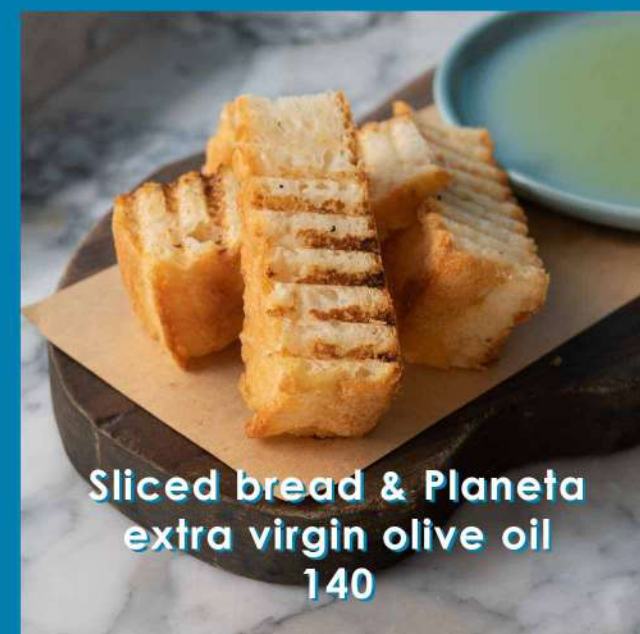
Sliced bread & Planeta extra virgin olive oil 140

* Price is subject to govt. tax * Delivery fee is excluded * Please allow our service team to reconfirm your order as some items might not be available