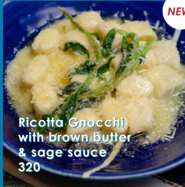
Ricotta Gnocchi with brown butter & sage sauce 320