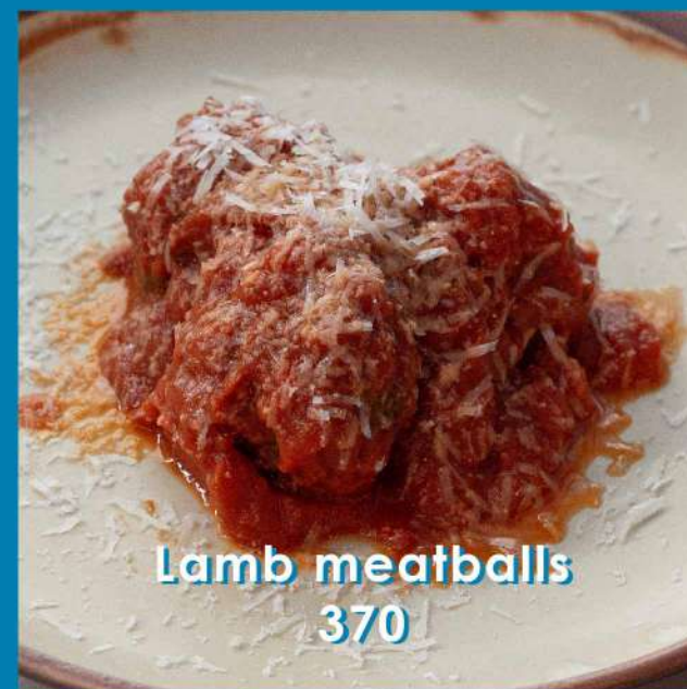
Lamb meatballs 370